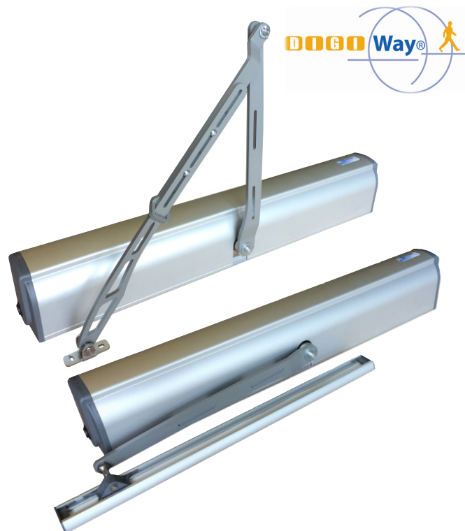
Door graph Figure.1

Setup is carried out using the inbuilt LCD and programming buttons or via the RF remote control making installation easy and hassle free. Operation is reliable, smooth and quiet thanks to the chain drive and integrated shaft encoder continually checking the status of the door being automated ensuring full compliance with EN16005.